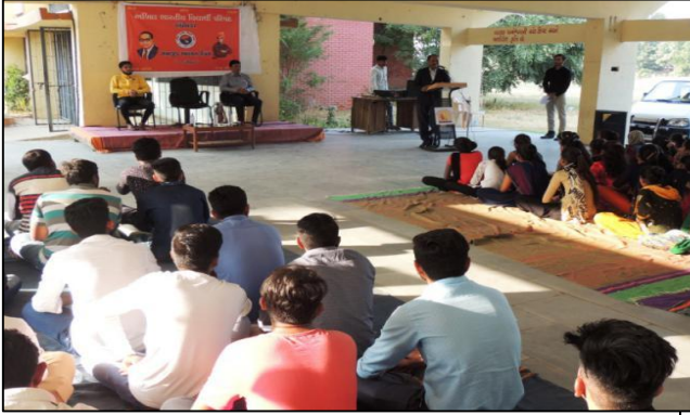
ડૉ. બાબાસાહેબ આંબેડકર નિર્વાણદિન નિમિત્તે આયોજિત કાર્યક્રમ