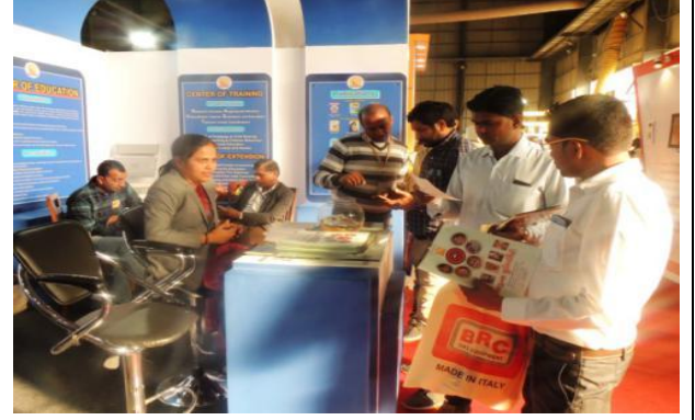
આયબ્રન્ટ ગુજરાત -૨૦૧૯માં સહભાગી ચિ. યુનિ.