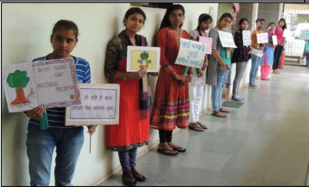
હોમસાઇન્સના વિદ્યાર્થીનીઓ દ્વારા પોસ્ટરમેકિંગ