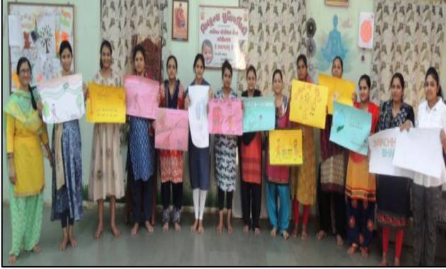
તપોવન કેન્દ્રની બહેનોએ બનાવ્યા સ્વચ્છતા અંગે જાગૃતિ દર્શાવતા વિવિધ પોસ્ટર