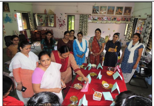
પોષણ સપ્તાહની ઉજવણી