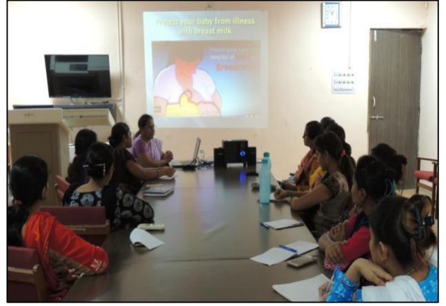
સ્તનપાન સપ્તાહ ઉજવણી