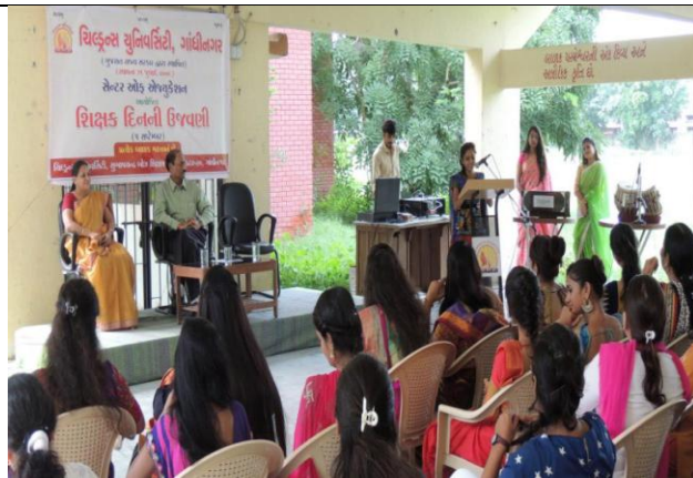
શિક્ષક દિવસની ઉજવણી