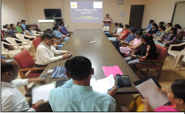
સ્વચ્છતા અભિયાન અંતર્ગત વકતૃત્વ સ્પર્ધા