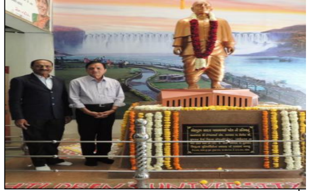
ચિ. યુનિ. ભવનમાં સરદાર વલ્લભભાઈ પટેલની પ્રતિમાનું અનાવરણ