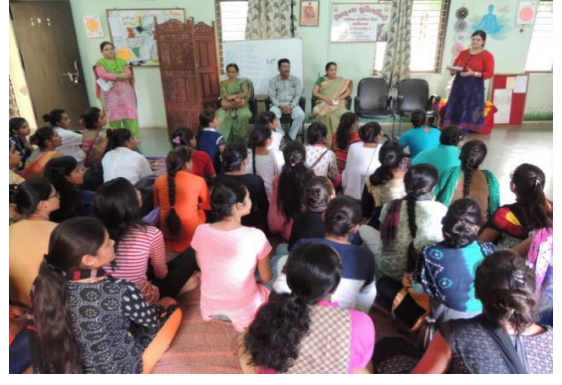
મહિલાગ્રામ વિદ્યાપીઠ- નારદિપુરની વિદ્યાર્થીનીઓ ચિ. યુનિ.ની મુલાકાતે