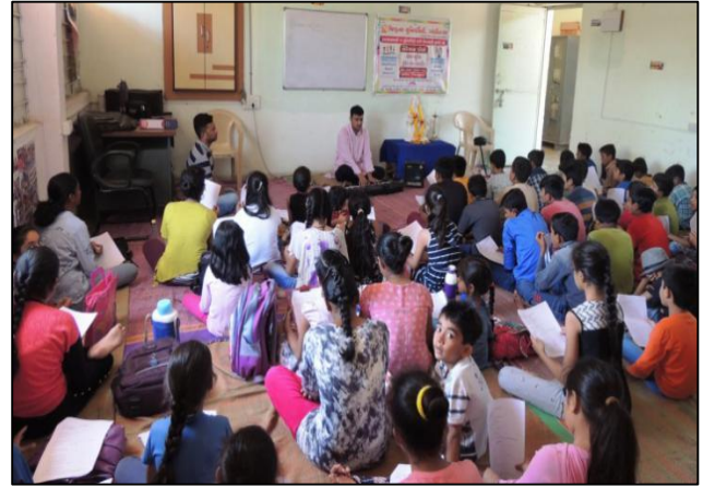
ચિ. યુનિ. દ્વારા આયોજિત ગાયન અને ચિત્ર કલા વેકેશન પ્રશિક્ષણ કોર્ષ