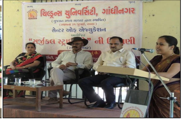
સર્જિકલ સ્ટ્રાઇકડેની ઉજવણી