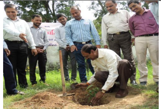
વિશ્વપર્યાવરણ દિનની ઉજવણી - વૃક્ષા રોપણ કાર્યક્રમ