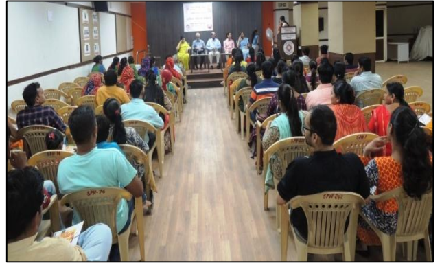
તપોવન પરિવાર સંમેલન - અમદાવાદ