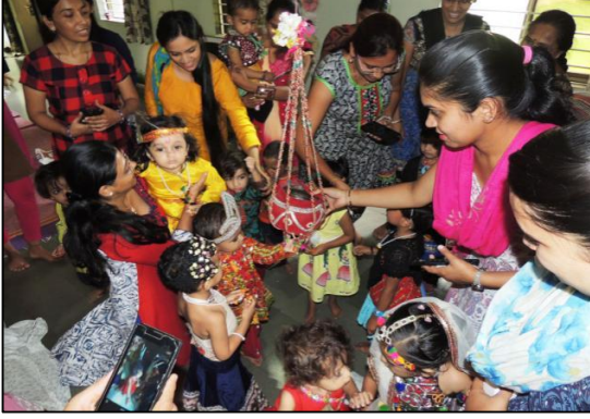
તપોવન કેન્દ્રમાં કૃષ્ણ જન્મોત્સવ