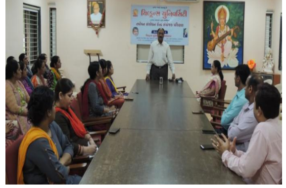
વિવિધ તપોવન સંશોધન કેન્દ્રોની બહેનોને પ્રશિક્ષણ અને તાલીમ