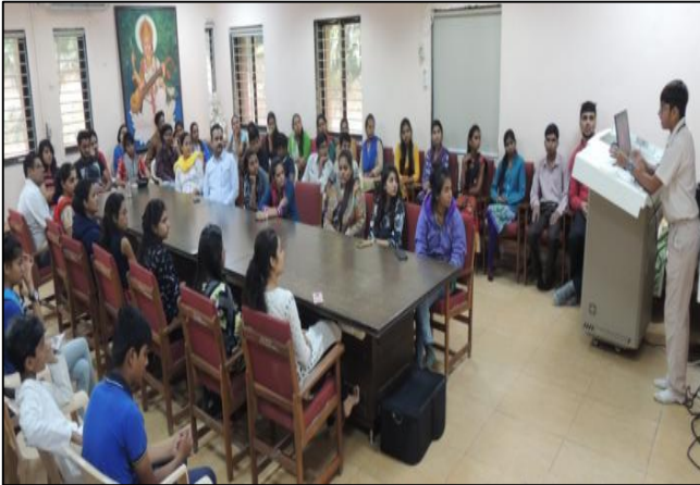
પ્લાસ્ટિક પ્રદુષણ અંગે જાગૃતિ માર્ગદર્શન આપતા માઉન્ટ કાર્મેલ શાળાના વિદ્યાર્થીઓ