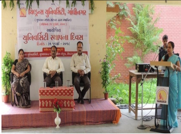
યુનિવર્સિટી સ્થાપના દિનની ઉજવણી