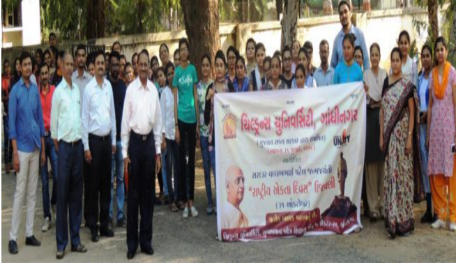
સરદાર વલ્લભભાઈ પટેલ જયંતીની ઉજવણી