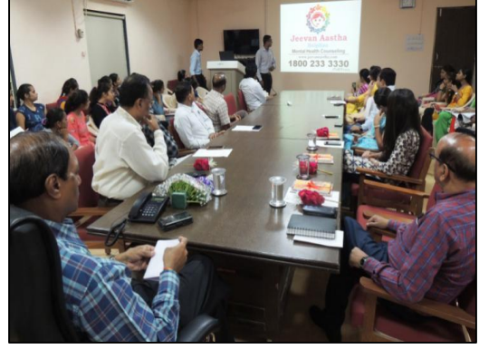
મનોવિજ્ઞાન વિભાગ દ્વારા માનસિક સ્વાસ્થ્ય અવેરનેસ કાર્યક્રમ