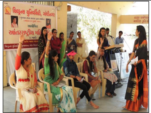
આંતરરાષ્ટ્રીય મહિલા દિવસની ઉજવણી