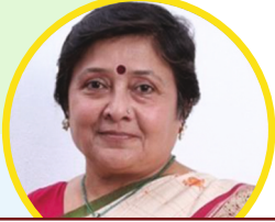
Smt. Vibhavaribahen Dave Hon. Minister of State Education, Women & Child Welfare, Gujarat State